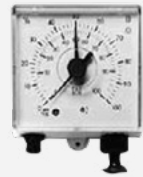
Pneumatic Tank Gauge

With a 4 – 20mA output, the Repeater Gauge is stainless steel bodied and can be wall or flush mounted