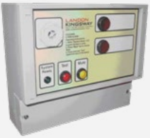
MK III FilGuard 2 Tank 40901017

The MK III FilGuard High & Low 2 Tank level unit provides high and low level alarms for 1 storage tank