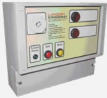
MK III FilGuard 2 Tank 40901015

The MK III FilGuard High & Low 2 Tank level unit provides high and low level alarms for 1 storage tank