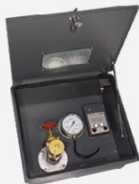
Oil Fill Point Cabinet

The cast iron Ventguard is designed to provide an ample cross sectional area to vent the displaced air from the tank.