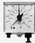
Pneumatic Tank Gauge

With a 4 – 20mA output, the Repeater Gauge is stainless steel bodied and can be wall or flush mounted