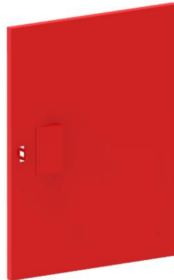
Dry Riser Vertical Cover Shown

Anti Vandal cover designed to fit over standard dry riser cabinets. The cover opens left to right via piano style hinge. It is locked by FB1 padlock supplied with cover. The rear of the cover allows for bolting to wall via multiple 10mm holes (Fixings not supplied). Supplied with Dry Riser Label.